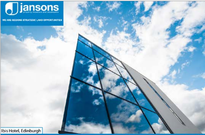
Ibis Hotel, Edinburgh