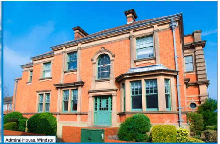
Admiral House, Windsor