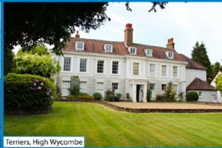
Terriers, High Wycombe