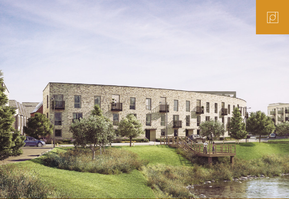
Barton Park. Image © Mosaics Oxford, Hill. Winner: Best Housing Development at 2019 OxPropFest Awards.