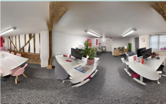
EDGE SPACE, THAME

edge UD have treated us to a video presentation portraying the creation of their work den in Thame. We've come to expect something different from this group of pioneering urban designers and they don't disappoint. An open collaborative space, their enthusiasm and joy for their project, with multiple hints of pink, shine through. The edge team is one to watch!