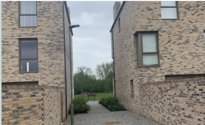
MOSAICS BARTON PARK

MOSAICS BARTON PARK, OXFORD The joint venture between Grosvenor and Oxford City Council continues to deliver on the essential housing needs for the region at Mosaics Barton Park. A real community spirit is emerging strongly out of the vision for the development which has brilliantly incorporated great design, community facilities and natural open spaces.