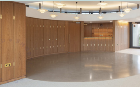
ST CATHERINE'S COLLEGE, OXFORD

The design and delivery of a new accommodation, study and recreational hub for graduates follow and complement the pioneering original 20th century design for the College. The team has achieved a beautiful synthesis of sympathetic architecture, exceptional materials and sustainable features, all of which enhance the original buildings and respect the surrounding environment.