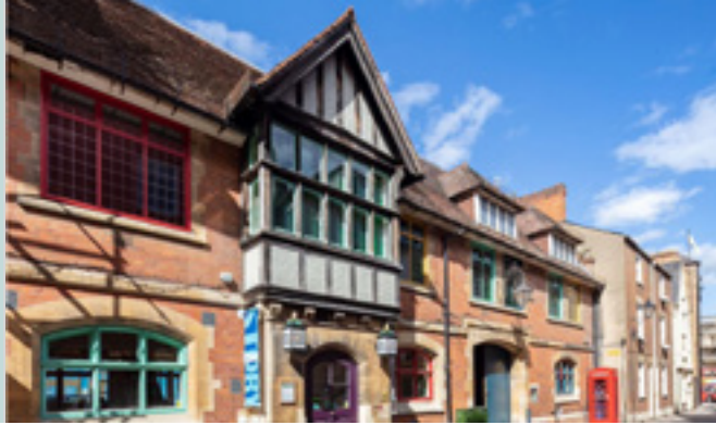
STORY MUSEUM, OXFORD

Another fascinating repurposing of a disused building in the heart of Oxford, the STORY MUSEUM occupies what used to be a telephone exchange in Pembroke Street. Architect Purcell was charged with enticing visitors to follow the stories displayed in the museum in a way which gave them and not the architecture of the space precedence. Recycling, renewable energy and natural ventilation, not to mention the bold use of colour, have all contributed to the sustainability of the new space and engagement with the local community, especially with schools, has made a major contribution towards the success and appeal of the project.