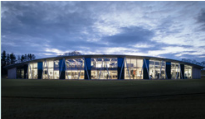
THE WING, HENLEY-ON-THAMES

Spratt and Partners' design brief for watchmaker Bremont's new HQ Building was uncompromising. Echoing the company's aeronautical heritage, the result is THE WING , a highly contemporary building integrated seamlessly into a countryside setting close to Henley on Thames. Achieving planning permission in an area not allocated for commercial development in the Local Plan was the first obstacle to be overcome. Collaborative working is encouraged by the light and spacious design of the administrative section of the building whilst a dust-free area has been created for the company's manufacturing and assembly processes. Beauty and function combined.